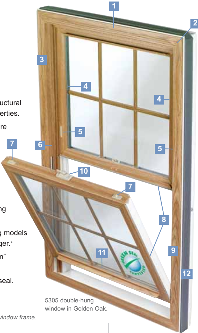
5305 double-hung window in Golden Oak.