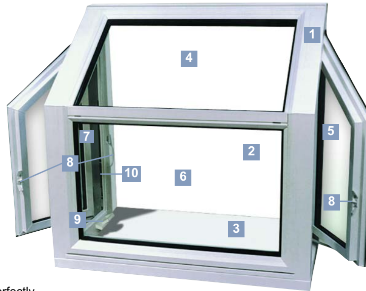
7100 Series Garden Window with two operating sashes.

Gorell Garden Windows are so strong and energy efficient that they meet uniform load structural and air infiltration performance criteria in accordance with AAMA (American Architectural Manufacturers Association) requirements.