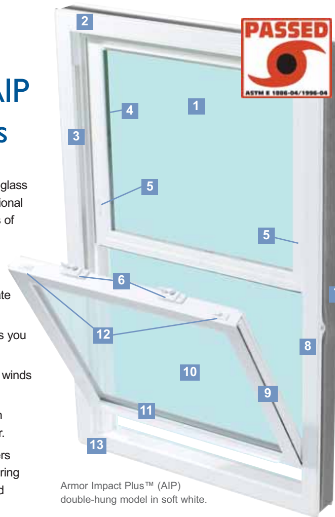
Armor Impact Plus™ (AIP) double-hung model in soft white.